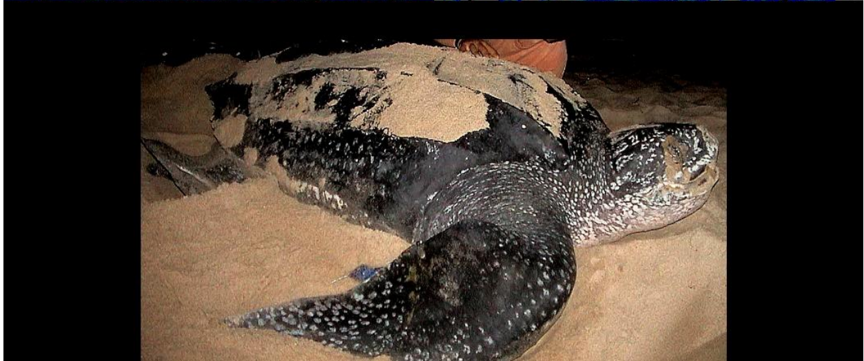
The object was a greenish-black, “garbage bag” color, reminiscent of a leatherback turtle.